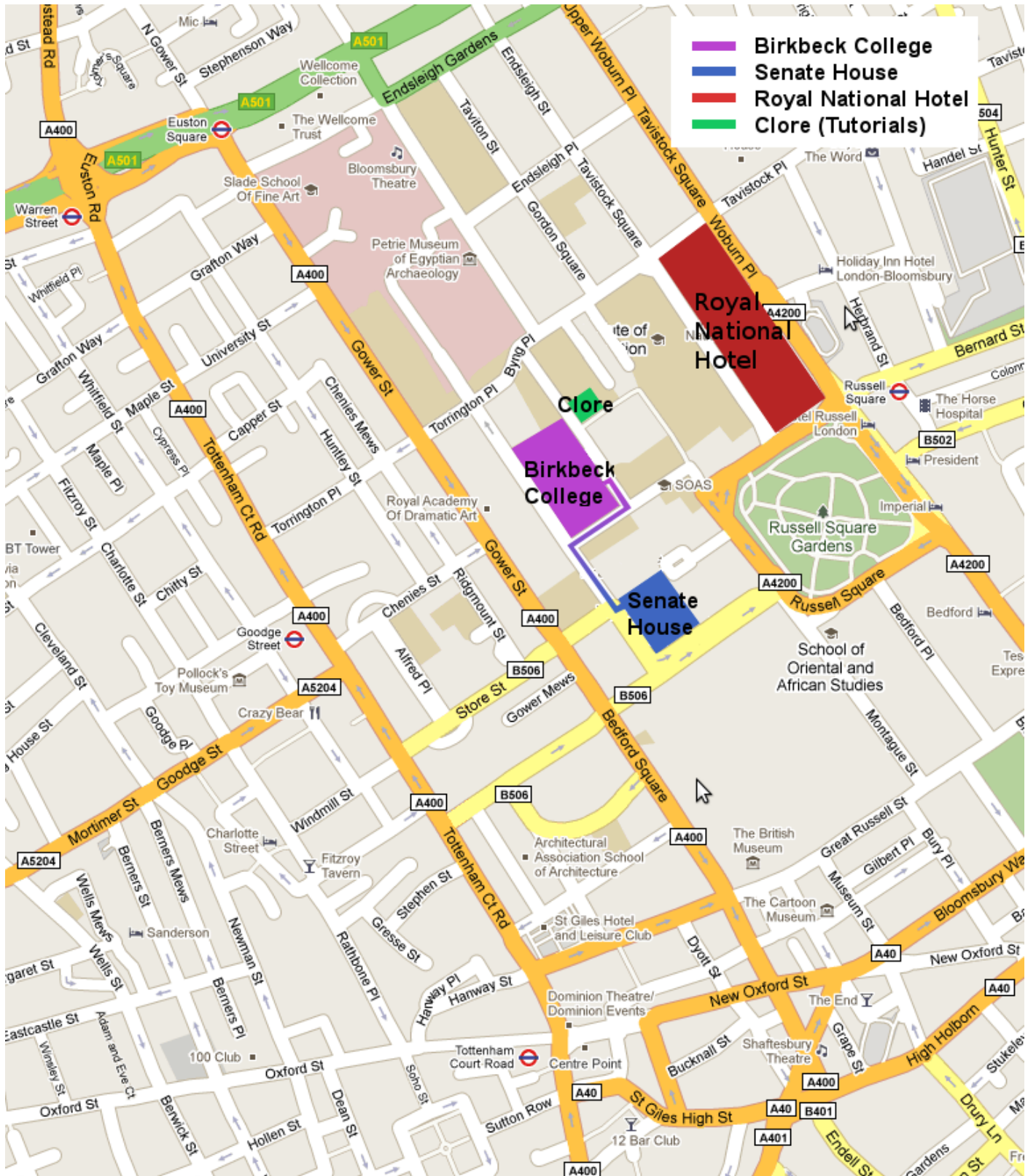
Map of the venue and nearby area